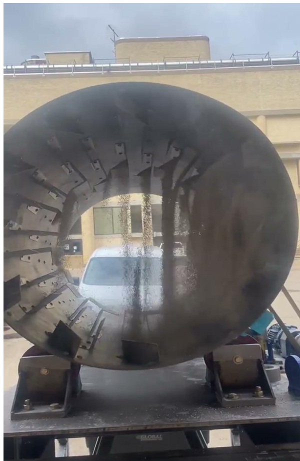
One Radial One 90